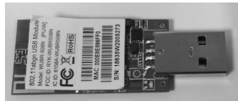
Model: WUBR-508N P/N 191231