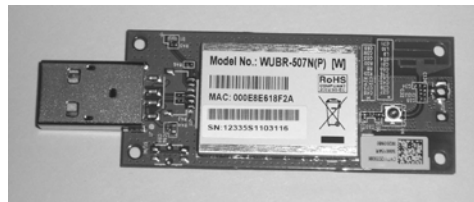
Model: WUBR-507N P/N 190911

The 802.11 b/g Wireless Network Adapter (P/N 365043-13) used in the 2008T hemodialysis machine is no longer available. Replacement models are Dual Band 802.11 b/g/n are shown in Figure 1. The part numbers under each image are for kits, which include this Field Service Bulletin, the Wireless Network Adapter and a model specific FCC/IC Label for the rear of the card cage.